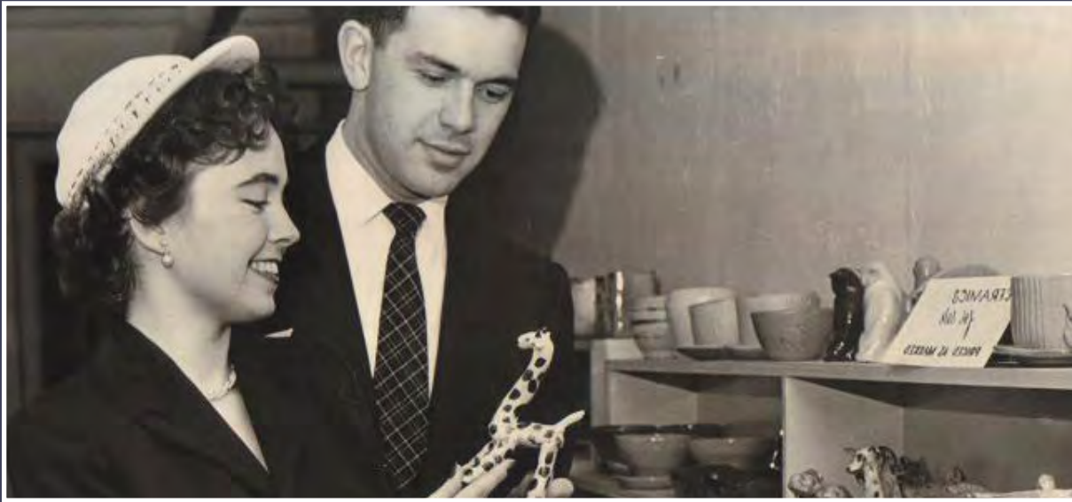
All Iowa Art Fair