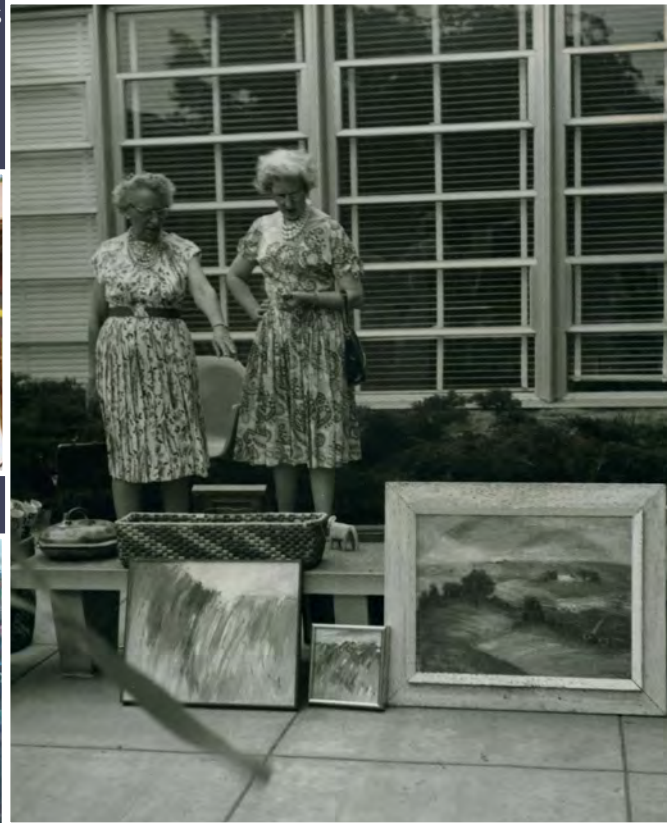
Iowa Artists Exhibition