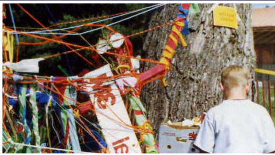
Art in the Park

After 40 years behind the Des Moines Art Center, Art in the Park moved downtown in 1998 and changed its name to Des Moines Arts Festival.