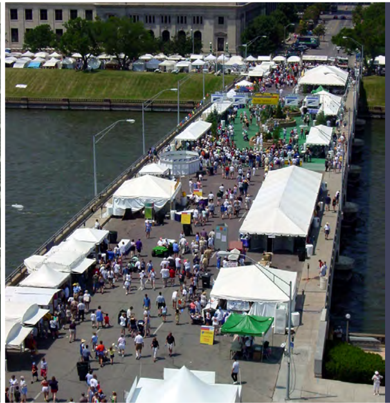
Des Moines Arts Festival, 1998