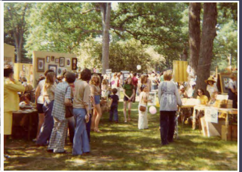
Art in the Park

After 40 years behind the Des Moines Art Center, Art in the Park moved downtown in 1998 and changed its name to Des Moines Arts Festival.