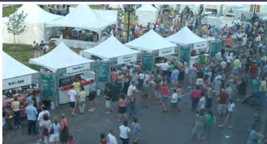
Des Moines Arts Festival, 2007